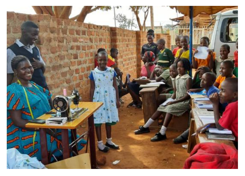
Alumni and a community member teaching sewing skills to students at one of the PEDN partner schools, July 2019

During the school year the alumni committees brought OB's and OG's into their former schools to help address challenges that the schools and their learners face, such as absenteeism , especially where many young people and their families do not see the value of education for their future and do not have money to spend on fees .